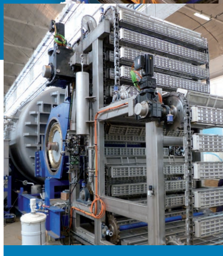
Front or pick & place loading