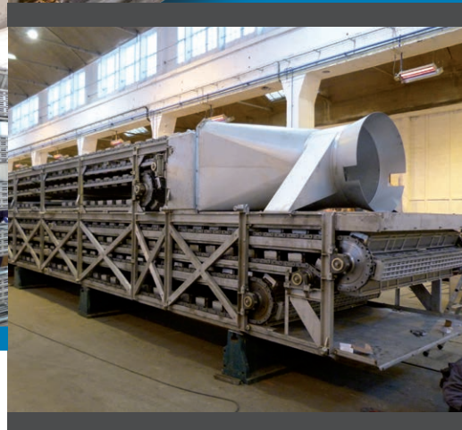
Internal frame with overpressure module