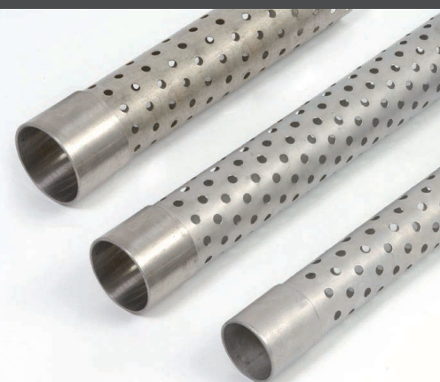
Tubular carriers for cans