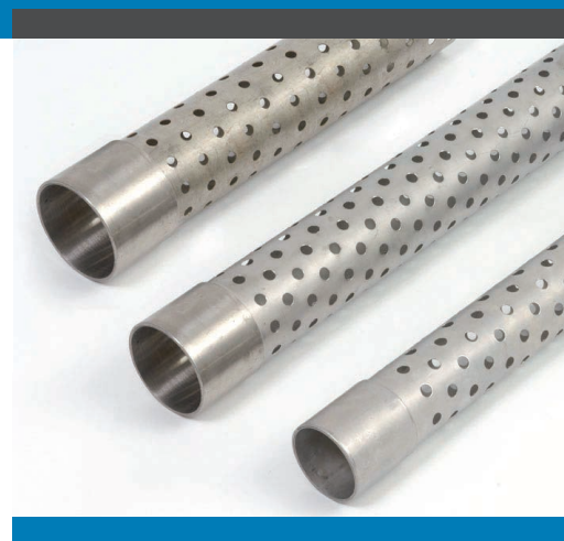
Tubular carriers for bottles